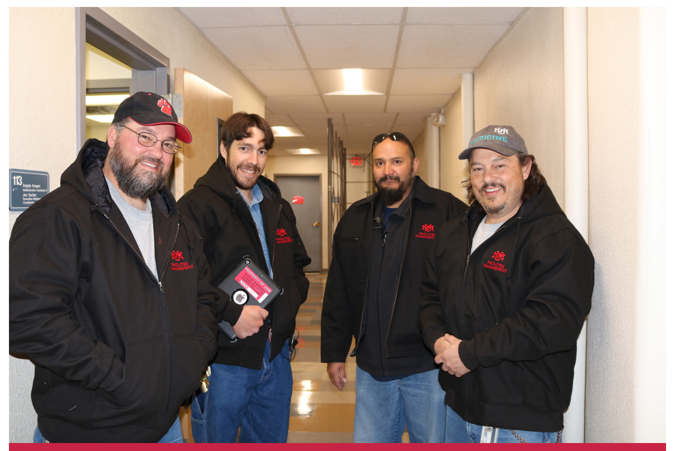
Area 3 Maintenance staff sporting new winter jackets with the updated logo.