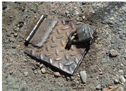
Bollard cover after