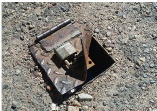
Bollard cover before.