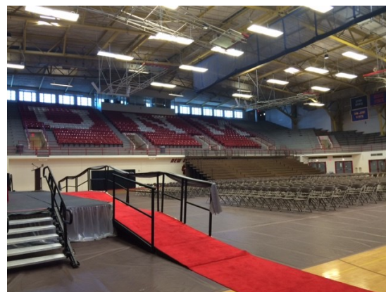
The Johnson Center College of Education and Anderson School of Management convocation set up.