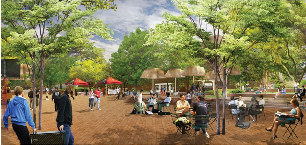
A schematic design created by MRWM Landscape Architects, McClain + Yu Architecture & Design, and Surfacedesign, Inc., Courtesy of Planning, Design, & Construction (PDC).

The UNM department Planning, Design, & Construction (PDC) have spent countless hours over many months gathering information from the UNM community in order to design a well-considered gathering place for the next generation of students, faculty, staff and UNM visitors. A majority of those surveyed would like to use the space to eat lunch, socialize, and relax with shaded seating and landscape.