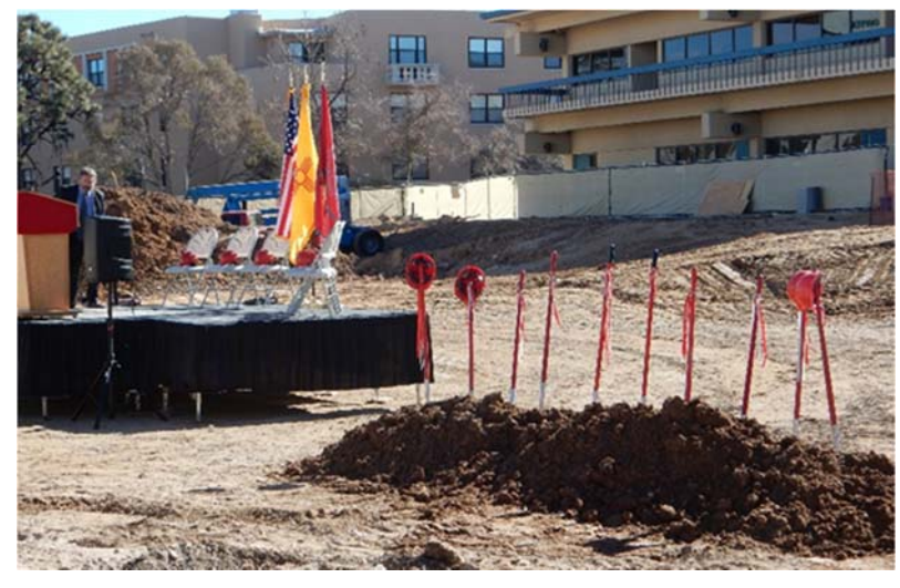
Special Activities staff made sure that everything was in its place as the Groundbreaking ceremony begins.

To read more about this event, <u>click here</u>.