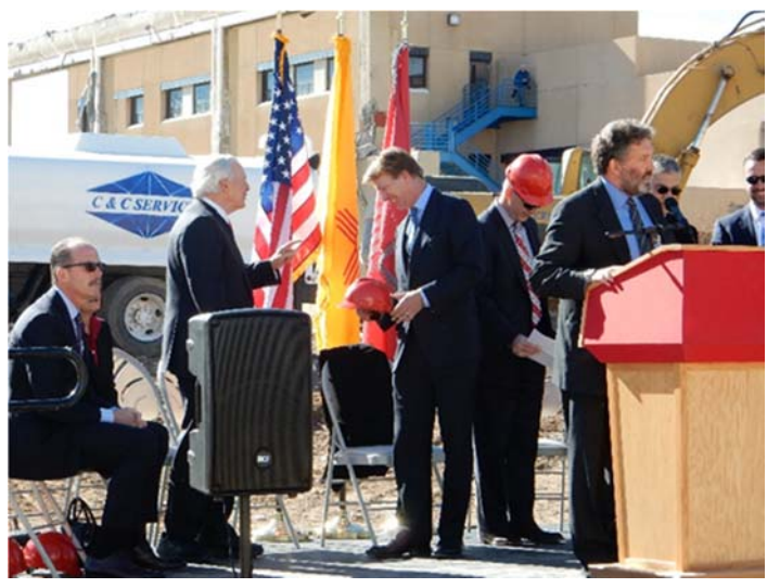
Dignitaries gather on the stage for the McKinnon Center for Management groundbreaking ceremony.