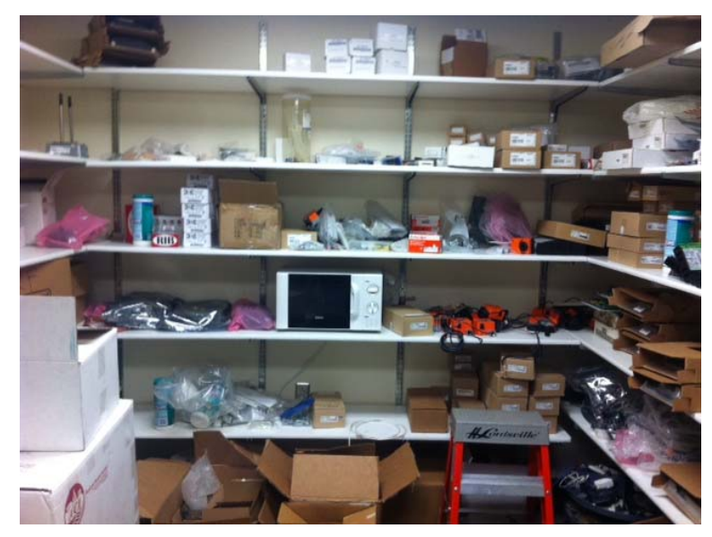
The north storage room in PRD Engineering & Energy Services before Acacia's organization.

(Continued) The system will charge the item scanned to the work order and deduct the item from the inventory. Just by going that extra mile and setting up bar codes helps our group run more efficiently and be more productive.