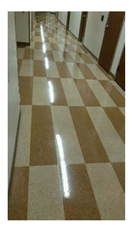
PPD Custodial Services' Floor Crew make the floors shine.