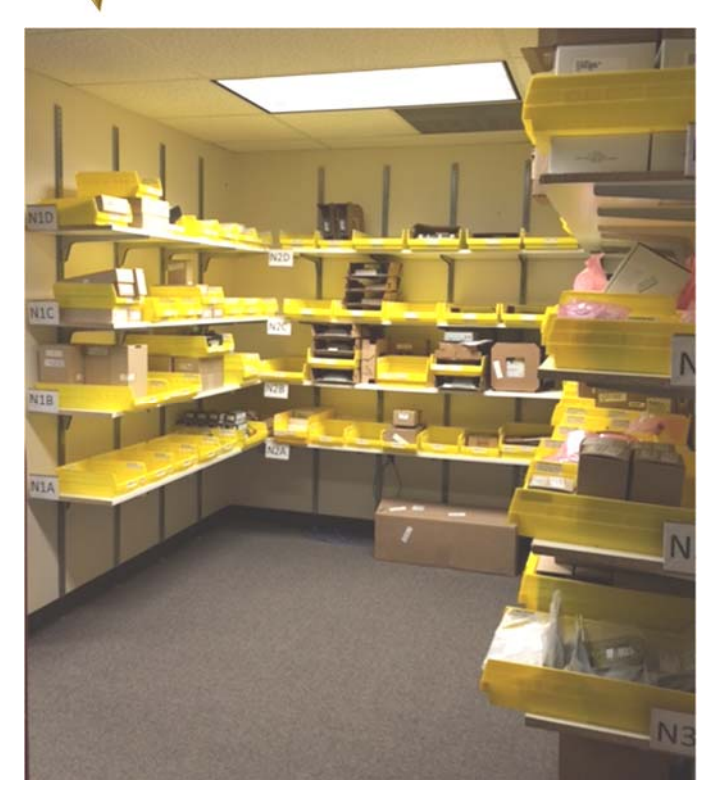
After the north storage room received a makeover.