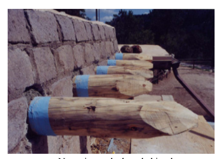
New viga ends threaded in place