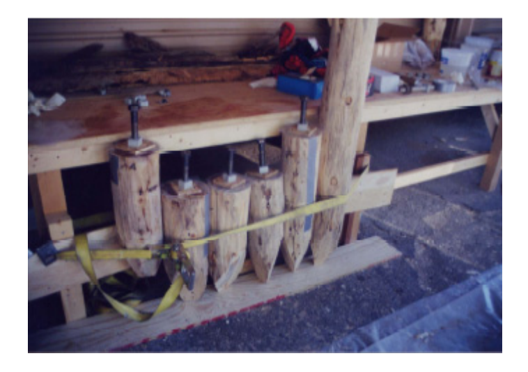
New viga ends after temporary insertion of threaded rods to create threaded mold.