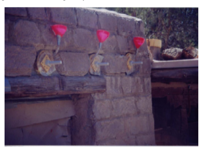
Existing viga ends with temporary epoxy filler tubes and permanent threaded rods installed.